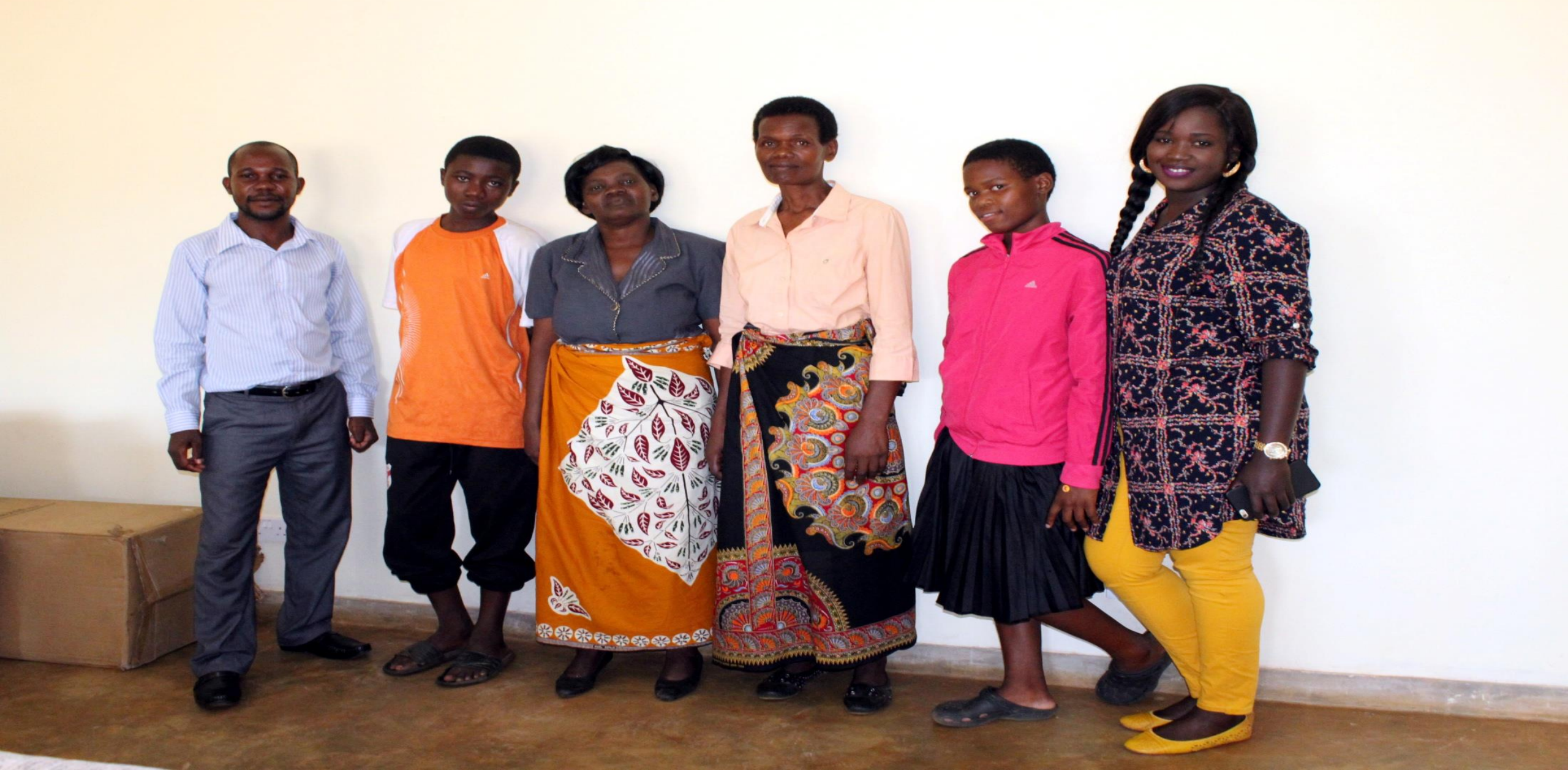
WINNERS OF IBA MBAYE SCHOLARSHIP IN MALAWI WITH THEIR PARENTS AND OLYMPAFRICA REPRESENTATIVE